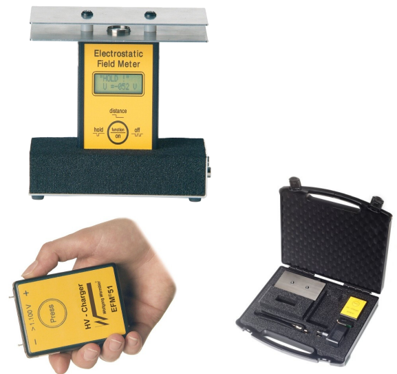
EFM51.CPS Charge Plate Kit

This document is prepared for our customers as a service, and is to the best of our knowledge true and accurate. However, it is understood and agreed by the users of this document that we will accept no liability for the conclusions reached. Users of this document may therefore wish to perform additional testing before determining that products mentioned are suitable.