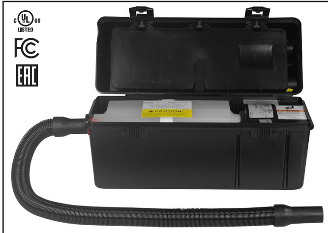
Figure 1. SCS 497 Electronic Service Vacuum