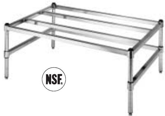
Stationary Dunnage Racks Without Mat