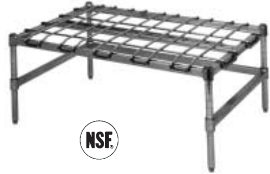
Stationary Dunnage Racks With Mat