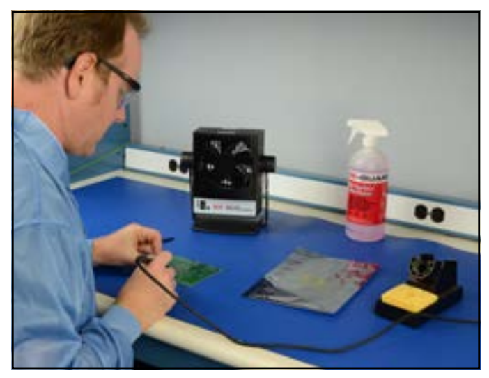
Figure 2. Using the 963E Benchtop Air Ionizer