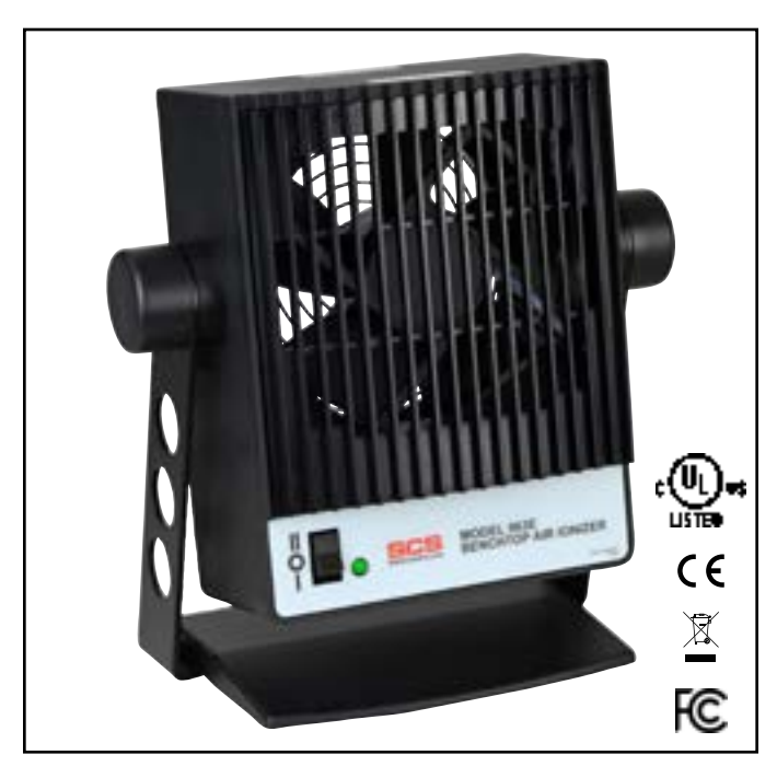
Figure 1. SCS 963E Benchtop Air Ionizer