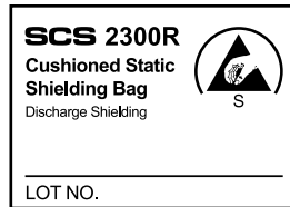
Label placed on Cushioned bag

Tolerances: Width: +/- 1/4" Length: +/- 1/4" Lip: 2" +/- 1/4" Seal width: 3/8" +/- 1/8"