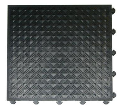
PV3010 Diamond Shield Tread