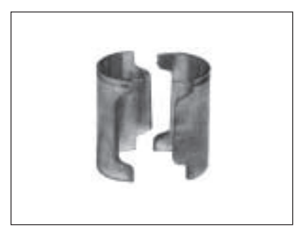
Aluminum Split Sleeves

Aluminum Split Sleeves with Stainless Steel Retainer Rings. Cat. No. 9986S