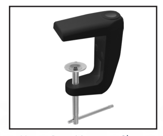
Heavy Duty Mounting Clamp