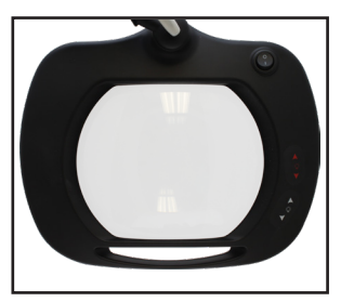
7.5" x 6.2", 5-Diopter Lens 2.25x Magnification