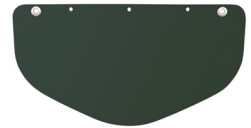
PR02093SP 3.0 Green Visor