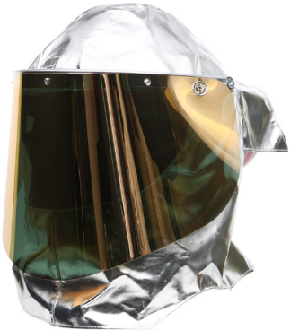
PR05627SP Secondary visor attachment bar, gold over clear visor with aluminized snood hood