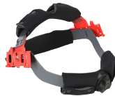
PR01600SP - Quick Release Adjustable/Removable Headband with Comfort Pads