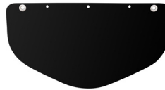
PR02102SP 5.0 Green Visor