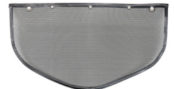
PR02090SP Metal Mesh Visor