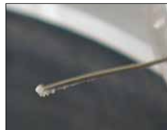
White fuzz on the tip of a tungsten wire emitter point.