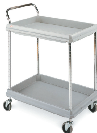
Deep Ledge Cart (2-shelf)

*Microban® and the Microban® symbol are registered trademarks of the Microban Products Company, Huntersville, NC.