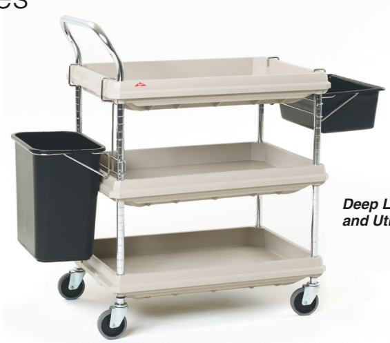
Deep Ledge Series with Wastebasket and Utility Bin Accessories