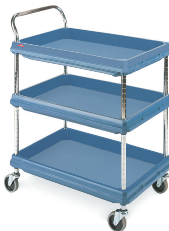
Deep Ledge Cart (3-shelf)

Blue with built-in Microban antimicrobial product protection