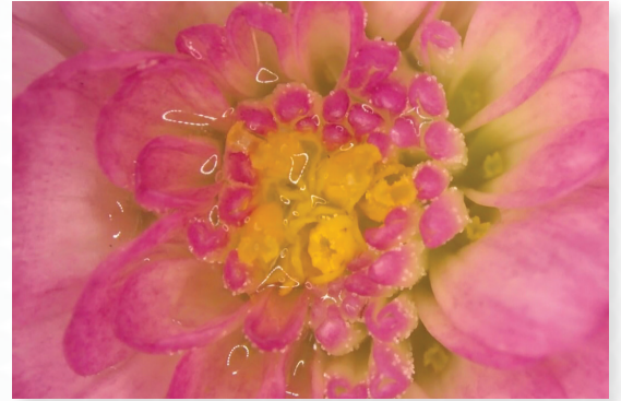
4K Ultra HD Capture High Resolution Images