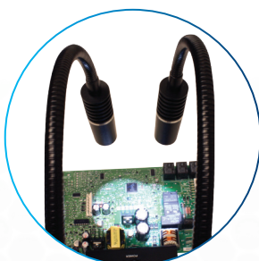
Illuminate and Overlap Spotlights at Any Angle