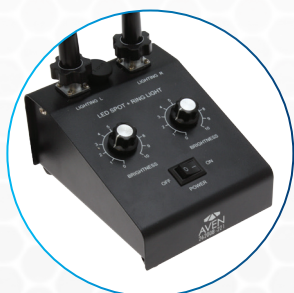
Light Adjustment Knobs for Each Illuminator and On/Off Switch on Metal Base