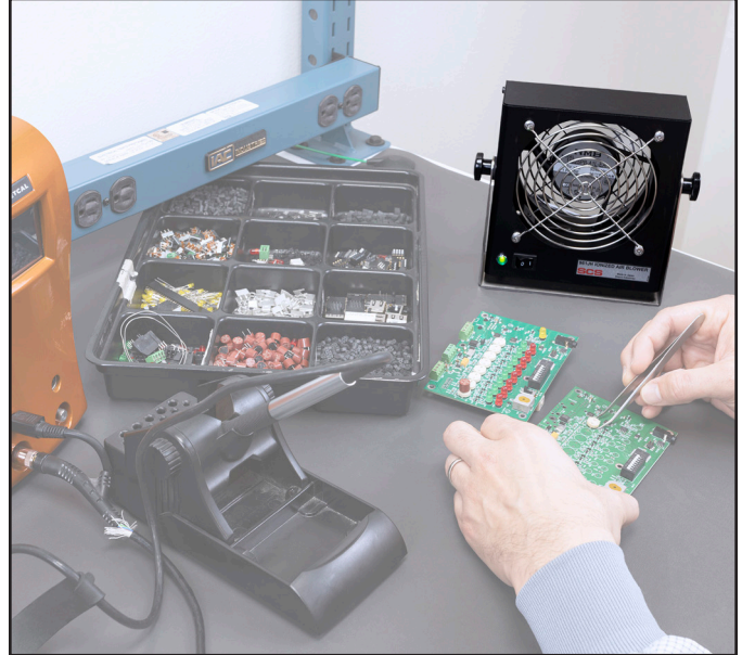
Figure 3. Using the 961JH Ionized Air Blower on a workbench