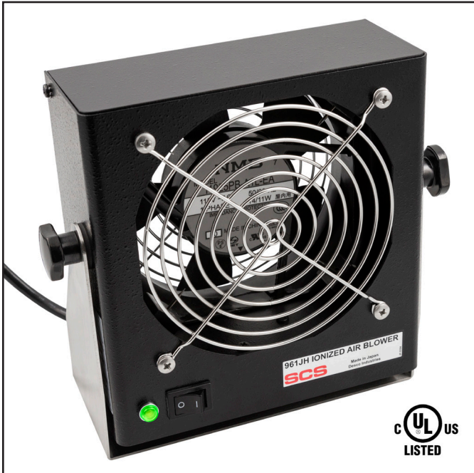
Figure 1. SCS 961JH Ionized Air Blower