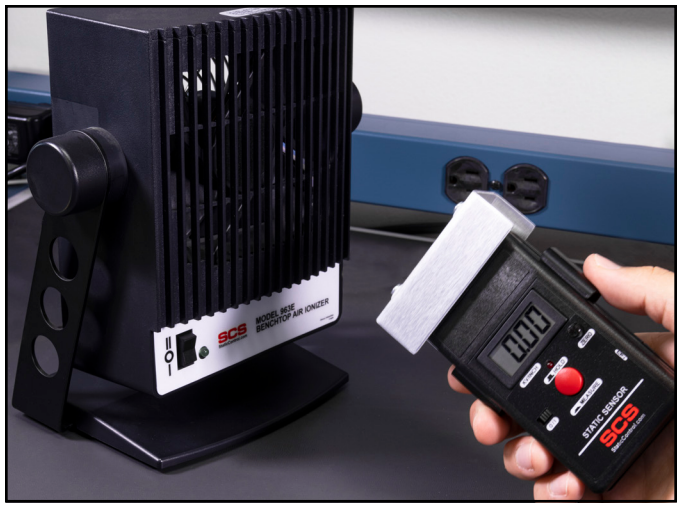
Figure 9. Using the Static Sensor with Conductive Plate to measure the offset voltage of a benchtop ionizer

NOTE: When testing pulsed ionizer systems, the voltage displayed is constantly changing. This pulse rate may be faster than the display update rate of the Static Sensor, therefore the displayed voltage is an average of the actual voltage. The output of the Static Sensor is useful in this situation for more accurate measurements.