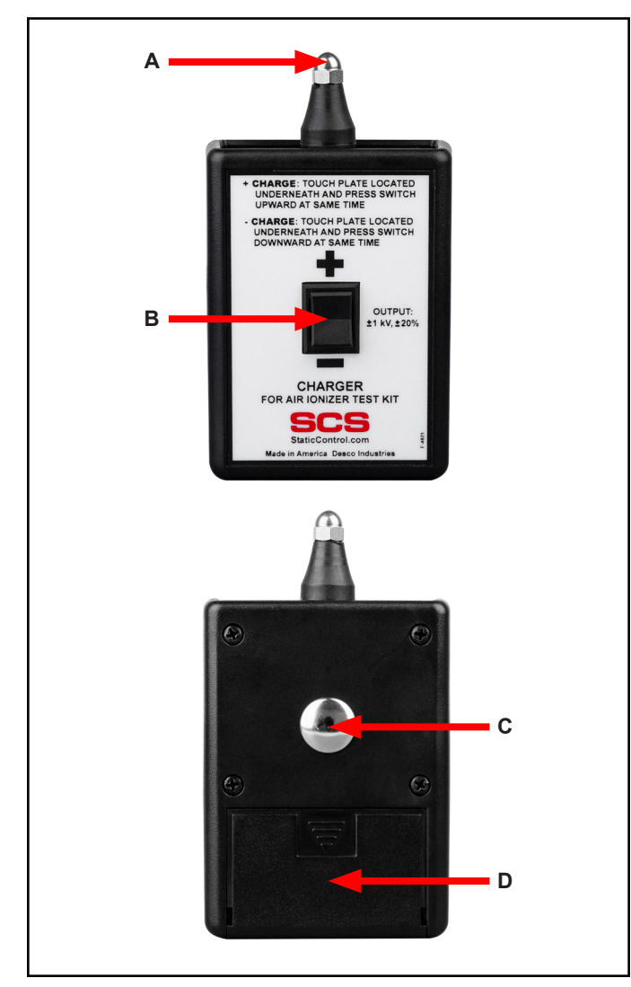
Figure 5. Charger features and components