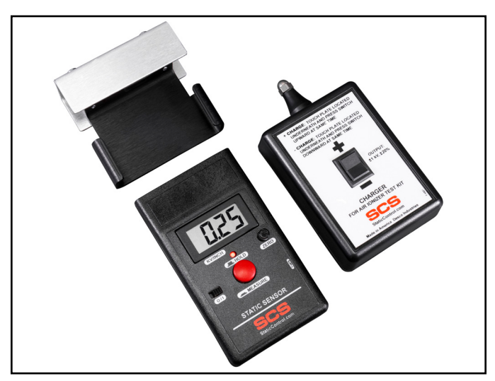
Figure 2. SCS 770717 Air Ionizer Test Kit