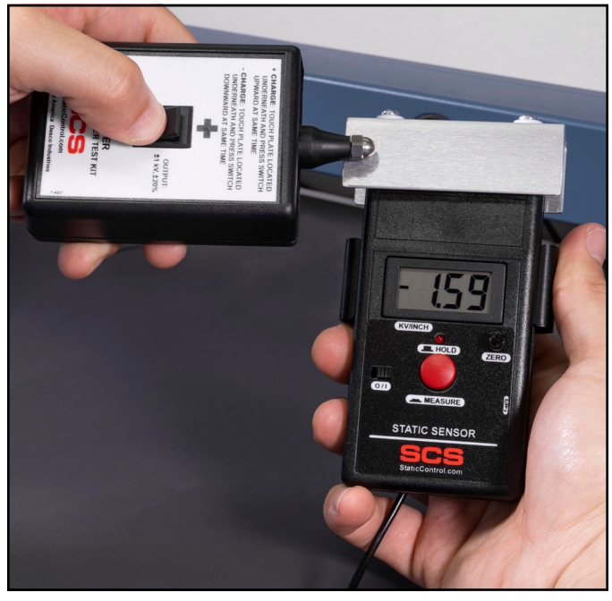
Figure 10. Using the Charger to apply a charge onto the Conductive Plate

NOTE: A ground path must be provided between the touch plate of the Charger and the ground reference of the Static Sensor. This is normally provided by holding the Charger in one hand and the Static Sensor with Conductive Plate in the other.