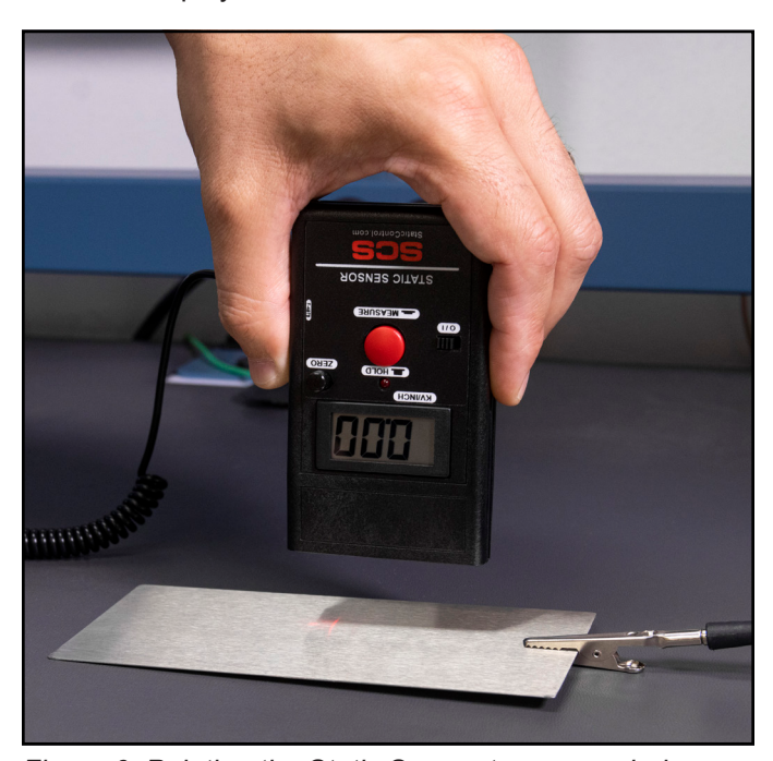
Figure 6. Pointing the Static Sensor to a grounded surface

Slide the power switch to the right to power the Static Sensor. Point the top of the Static Sensor approximately 1 inch (2.5 cm) away from a grounded metal surface. Proper spacing is indicated when the two red bullseyes emitted LED range indicator become centered on top of each other. Turn the rotary zero knob until the Static Sensor's display reads 0.00.