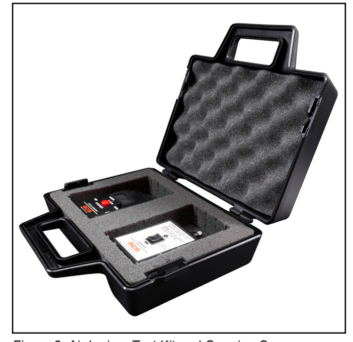
Figure 3. Air Ionizer Test Kit and Carrying Case