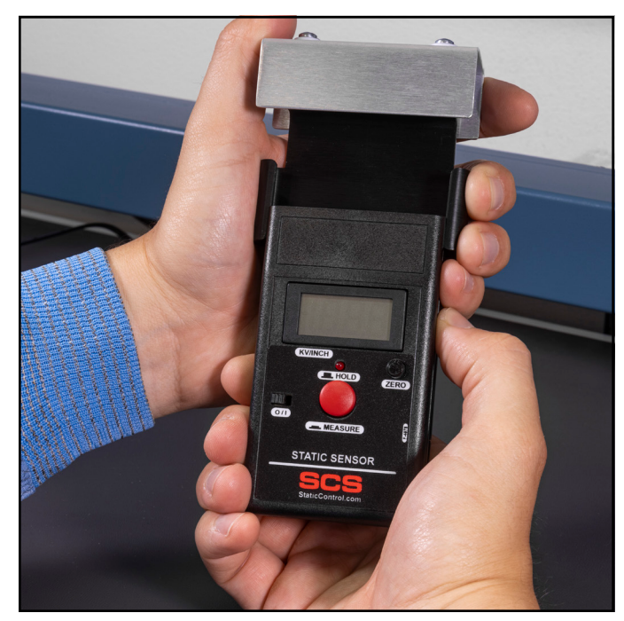
Figure 8. Sliding the Conductive Plate onto the Static Sensor