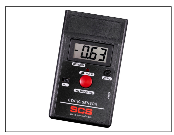
Figure 1. SCS 770716 Static Sensor