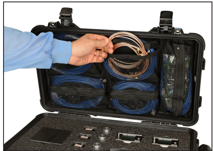
Figure 2. Using the the lid organizer to store accessories

Per ANSI/ESD S20.20 section 6.1.3.1 Compliance Verification Plan Requirement "A Compliance Verification Plan shall be established to ensure the organization's compliance with the requirements of the Plan. Formal audits or certifications shall be conducted in accordance with a Compliance Verification Plan that identifies the requirements to be verified, and the frequency at which those verifications must occur. Test equipment shall be selected to make measurements of appropriate properties of the technical requirements that are incorporated into the ESD program plan."