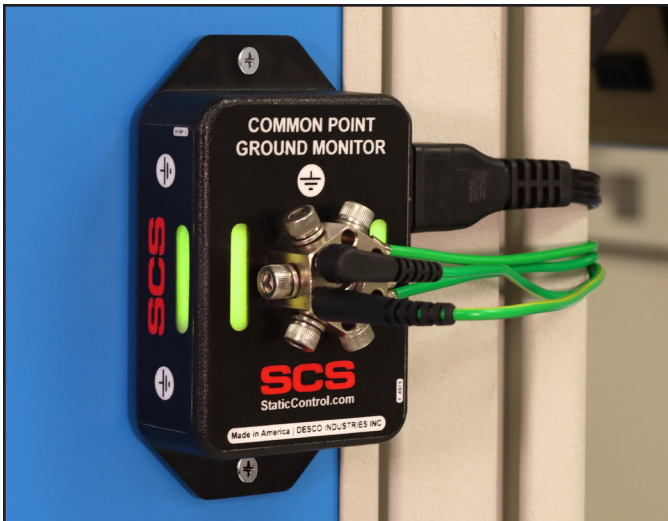
Figure 4. Using the Common Point Ground Monitor

Use the banana jacks on the ground hub to connect banana plugs to ground. Use the 6 included socket head screws and split washers to secure ground wires with ring terminals.