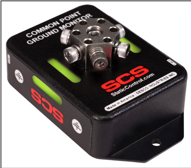
Figure 1. SCS Common Point Ground Monitor