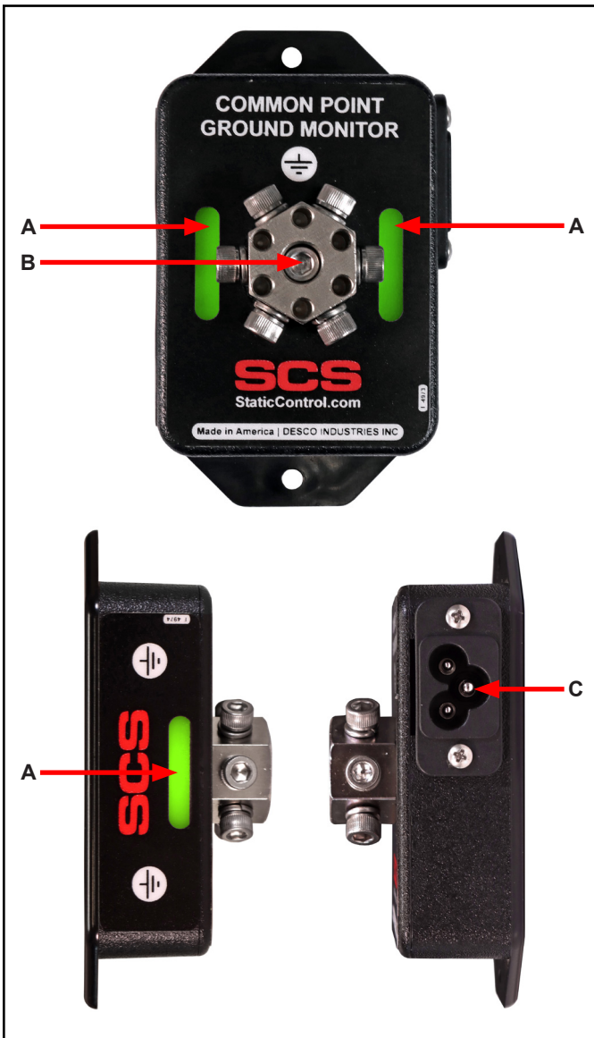
Figure 2. Common Point Ground Monitor features and components

A. Status LEDs: Illuminates green when the AC outlet is properly wired and its path to equipment ground via the equipment ground conductor is intact. Illuminates red and audible alarm sounds when the AC outlet is not properly wired and its path to equipment ground via the equipment ground conductor is broken.