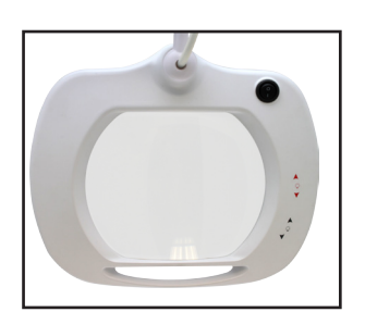
7.5 Inch x 6.2 inch/ 3 Diopter Lens 1.75x Magnification