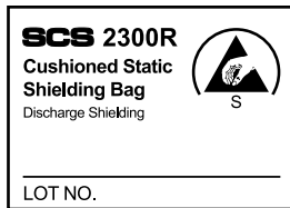
Label placed on Cushioned bag