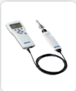
RH/C° Data Recorder NIST Certifiable RH/ Temp data logging units