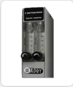
Xtra-GAS N2 Systems