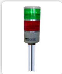
Alarm Light Tower