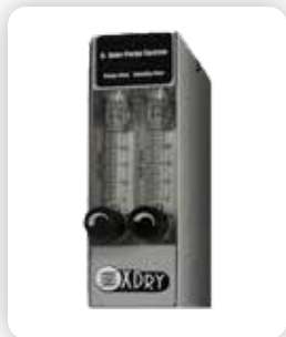
Xtra-GAS N2 Systems