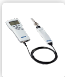
RH/C° Data Recorder NIST Certifiable RH/ Temp data logging units