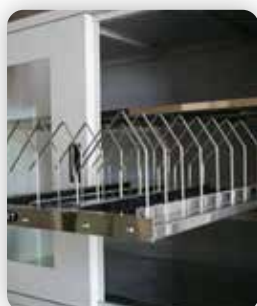
Sliding Reel Rack