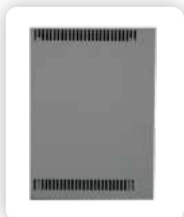
Additional Dryer Modular Dryer System X133